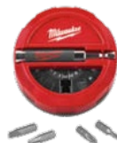
21 Pc Drive Guide Set 48-32-1700