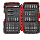
40 Pc Drive Guide Set 48-32-1505