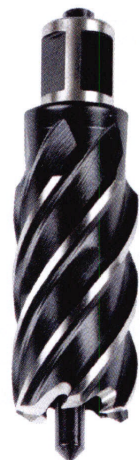
EJECTOR PIN SOLD SEPARATELY

25 sizes available. From 1/2" to 2" diameter hole sizes, 2" depth.