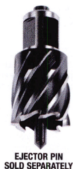
EJECTOR PIN SOLD SEPARATELY

25 sizes available. From 1/2" to 2" diameter hole sizes, 1" depth.