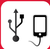
In-Pocket USB Port Charges portable electronic devices