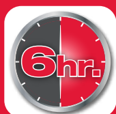
Up to 6 Hours of Continuous Heat