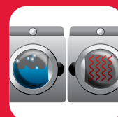
Washer and Dryer Safe