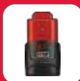
Powered by M12™ REDLITHIUM™ Batteries