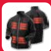
5 Heating Zones Chest, Back, Pockets