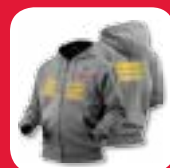
3 Heating Zones Chest and Back