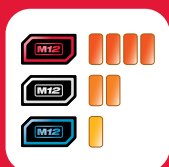
Easy Touch Heat Controller 3 heat settings per zone