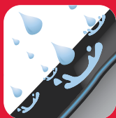
Water and Wind Resistant

Powered by M12™ REDLITHIUM™ Battery Technology, Milwaukee® M12™ Cordless Heated Gear distributes heat across core body areas and stops cold dead in its tracks. Durable carbon fiber heating elements woven in between rugged exterior materials and thermal insulating liners generate and maintain heat to keep you moving in any weather condition. On or off the jobsite, Milwaukee® M12™ Heated Gear provides up to 6 hours of continuous heat per battery charge for use in all seasons and outdoor environments. M12™ REDLITHIUM™ Batteries are compatible with over 60 power tool solutions, from Milwaukee®.