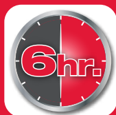
Up to 6 Hours of Continuous Heat