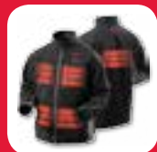
5 Heating Zones Chest, Back, Pockets