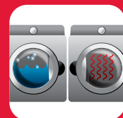
Washer and Dryer Safe