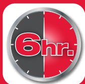
Up to 6 Hours of Continuous Heat