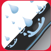
Water and Wind Resistant

Powered by M12™ REDLITHIUM™ Battery Technology, Milwaukee® M12™ Cordless Heated Gear distributes heat across core body areas and stops cold dead in its tracks. Durable carbon fiber heating elements woven in between rugged exterior materials and thermal insulating liners generate and maintain heat to keep you moving in any weather condition. On or off the jobsite, Milwaukee® M12™ Heated Gear provides up to 6 hours of continuous heat per battery charge for use in all seasons and outdoor environments. M12™ REDLITHIUM™ Batteries are compatible with over 60 power tool solutions, from Milwaukee®.