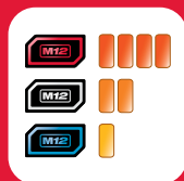
Easy Touch Heat Controller 3 heat settings per zone