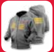
3 Heating Zones Chest and Back