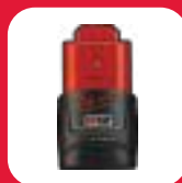
Powered by M12™ REDLITHIUM™ Batteries