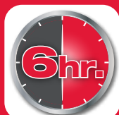
Up to 6 Hours of Continuous Heat