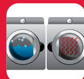
Washer and Dryer Safe