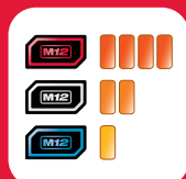
Easy Touch Heat Controller 3 heat settings per zone