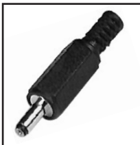
30-336 Coaxial AC/DC power plug. 1.0mm I.D. 3.8mm O.D. .17" cable opening.