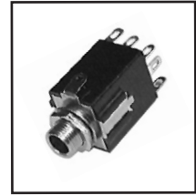
30-385 Stereo 1/4" Audio Jack. with DPDT normally closed and normally open circuits.