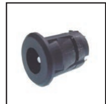
30-720-2.1 2.1mm version 30-720-2.5 2.5mm version Chassis mount snap-in coax power jack. Nickel plated connector with black molded trim. Mounts in .375" hole, up to .07" panel thickness