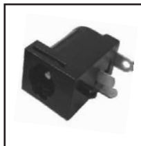
30-616-2.1 30-616-2.5 Locking DC power coax jack with N/C switch on sleeve side of the connector. Insert 30-617 plug and twist clockwise to lock.