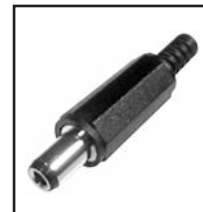
30-375 DC coax power plug. 3mm I.D., 6.3mm O.D., 9.5mm long. With strain relief. .20" cable opening.