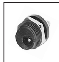
30-314 2.1mm I.D. X 5.5mm O.D. 30-315 2.5mm I.D. X 5.5mm O.D. Chassis mount coax power jack. Plastic housing. Mounts in 1/2" dia. hole. N/C switch.