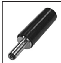
30-372 Coax power plug. 1.3mm I.D. 3.5mm O.D. 9.5mm long. .15" cable opening. 30-372-P With strain relief. .16" cable opening.