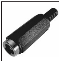
30-333 2.1mm 30-334 2.5mm coax inline Female connector. Available in 2.1mm and 2.5mm versions O.D. = 5.5mm .15" cable opening.