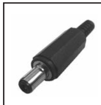
30-617-2.1 30-617-2.5 Locking DC power coax plug 5.5 O.D., 9.5mm long. Insert into 30-616 jack and twist clockwise to lock. .14" cable opening.