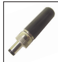
30-623-2.1 30-623-2.5 Locking DC power coax plug. Mates with 30-624 jack. Threaded locking style. Available in 2.1mm or 2.5mm I.D. .18" cable opening.