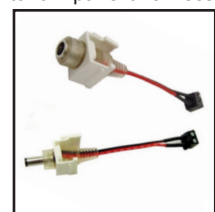
30-730 2.1mm solderless inline DC Coax power plug. 30-731 2.1mm solderless inline DC Coax power jack.