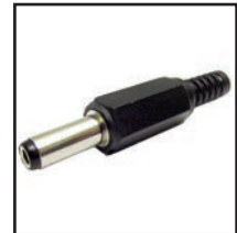
30-373-14MM 2.1mm Version 30-374-14MM 2.5mm Version 14mm connector shaft, plastic body with strain relief, .15" cable opening.