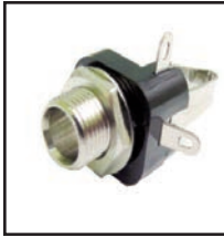
30-412A Closed Circuit 1/4" Mono Audio Jack. .35" x .29" bushing. .36" hole size, will work with standard .375" hole.

Technical drawings and specifications are available for these connectors. Please ask your Calrad sales representative for details.