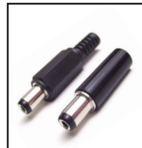
30-373 Bakelite Barrel 30-373-P With Strain Relief. Coax power plug. 2.1 mm I.D. 5.5 mm O.D. 9.5 mm long. .15" cable opening.