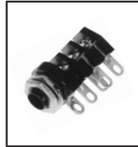
30-398 1/4" Audio Jack. 3-Circuit, 2 Closed. 3/8" bushing. Mounts in .355" hole.