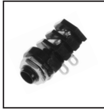
30-395 Open Circuit. 30-396 1/4" Audio Jack. Closed Circuit 2-Conductor. 3/8" bushing. Mounts in .355" hole.