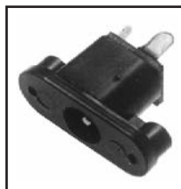
30-371 Coax power jack, standard chassis mount, 2.1mm pin. Switched circuit. 17mm mount center.