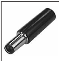
30-374 Bakelite Barrel 30-374-P With Strain Relief. Coax power plug. 2.5mm I.D. 5.5mm O.D. 9.5 mm long. .15" cable opening.