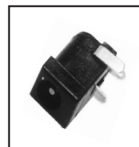
30-370-2.1 2.1 mm pin, 30-370-2.5 2.5 mm pin, PC mount coax power jack, switched circuit.