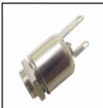
30-624-2.1 30-624-2.5 Chassis mount locking DC power coax jack. Mates with 30-623 plug. Mounts in panels up to .07".