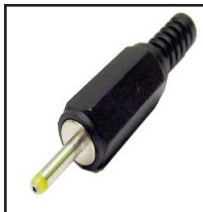
30-337 Coax AC/DC power plug 2.35mm O.D., .7mm I.D. .17" cable opening with strain relief.