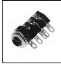
30-397 1/4" Audio Jack. Open Circuit 3-Conductor. 3/8" bushing. Mounts in .355" hole.