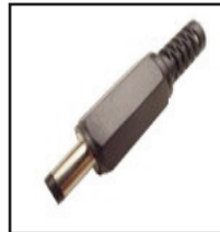
30-635 Coax AC/DC power plug 4.75mm O.D., 1.7mm I.D., 9.2mm long, .17" cable opening. 30-632 same as 30-635 with O.D. of 4mm.