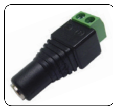
30-333T SOLDERLESS COAX POWER CONNECTORS DC 2.1mm female jack to 2 pin screw terminal block adapter. Excepts up to 18 Awg wire.