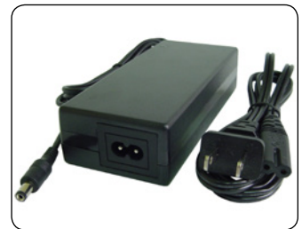
45-608-HG 12VDC, 6 AMP L.E.D. LIGHTING POWER SUPPLY