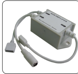
92-354 RGB Power Amplifier 72 Watts