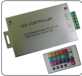
92-348 RGB Controller with Remote 144 Watts