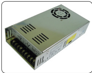
45-609-HG 12VDC, 29 AMP L.E.D. LIGHTING POWER SUPPLY