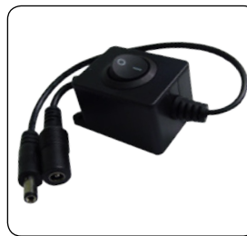
92-343 ON/OFF Compact Power Supply In Line Switch