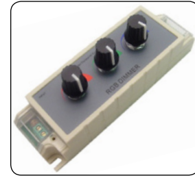
92-340 Manual RGB Controller