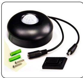
92-337 PIR Motion Sensor 5 Amp