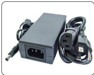
45-608 12VDC, 5 AMP L.E.D. LIGHTING POWER SUPPLY

Calrad's new high efficiency switchmode power supply is specifically designed for White or colored (RGB) L.E.D. lighting applications. Using Calrad's 30-333T adapter you can easily connect wiring to (+), (-) screw terminals without the need for soldering or splicing cables together.