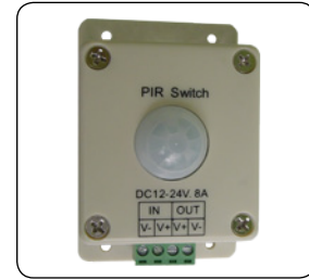
92-336 PIR Motion Sensor Switch 8 Amp