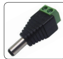
30-373T SOLDERLESS COAX POWER CONNECTORS DC 2.1mm male plug to 2 pin screw terminal block adapter. Excepts up to 18 Awg wire.