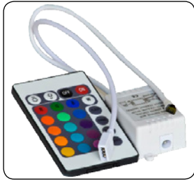
92-341 Lighting Control Module, Remote