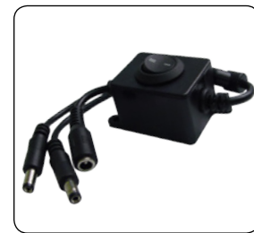
92-344 ON/OFF Compact Power Supply 1 by 2 InLine Switch