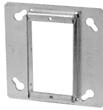
BC52-C-49-1/2 to CI52-C-51-2