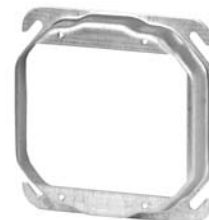
BC52-C-17 to CI52-C-18-5/8