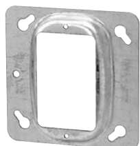
CI52-C-10 to CI-52-C-62