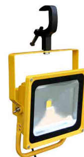
LE965LED-CLAMP Clamp mount model