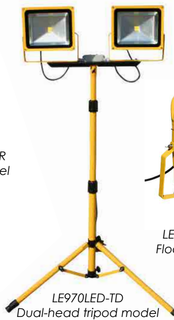
LE970LED-TD Dual-head tripod model