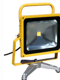
LE965LED-FS-DC Floor stand model