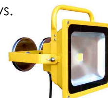
LE970LED-MAG-DC Magnet mount model