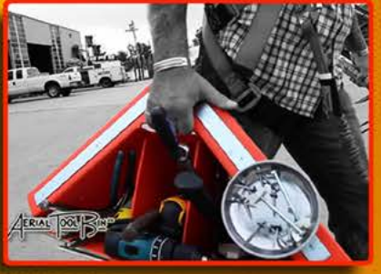
*Tools sold separately