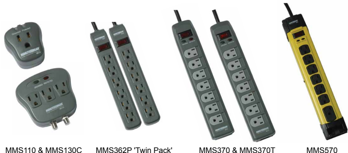
MMS110 & MMS130C MMS362P 'Twin Pack' MMS370 & MMS370T MMS570