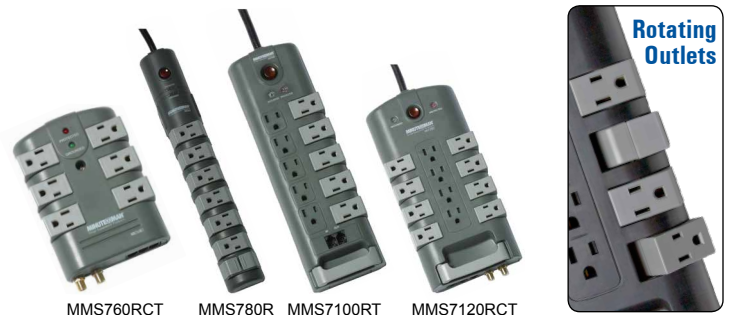
MMS760RCT MMS780R MMS7100RT MMS7120RCT