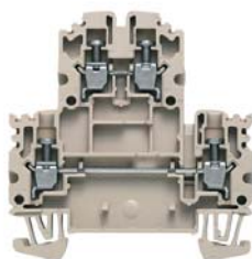
WDK 2.5 ZQV