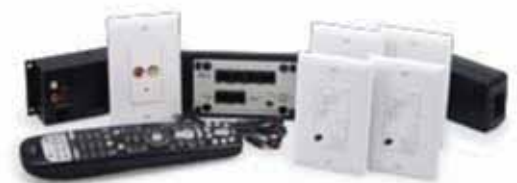
AU7400-XX lyriQ Single Source, 4-Zone Kit