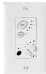
AU1000-XX lyriQ High-Performance Keypad