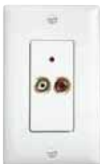
F7417-XX lyriQ Local Source Input