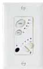
AU7394-XX lyriQ Keypad