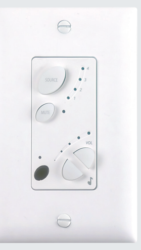
lyriQ Keypad (AU7394-XX)

Built on Cat 5 cabling, the lyriQ Audio System includes easy installation features such as convenient RJ45 connections.