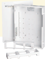
FOXBOX™ HOME ENCLOSURE