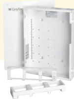
FOXBOX™ HOME ENCLOSURE