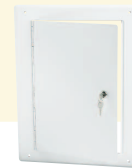
HINGED COVER FOR FOXBOX™