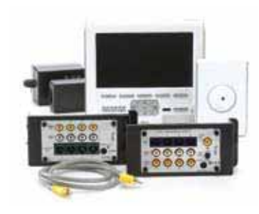
CM5451-WH Camera and LCD Kit