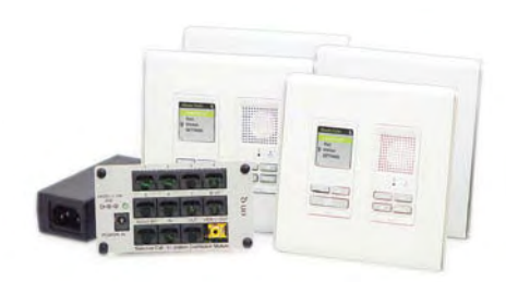
IC5400-XX Selective Call Intercom 4-Location Kit