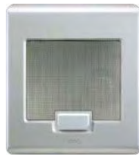
IC5002-XX Selective Call Intercom Door Unit