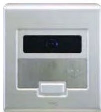
IC5003-XX Selective Call Intercom Video Door Unit