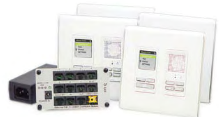
IC5400-XX Selective Call Intercom 4-Location Kit