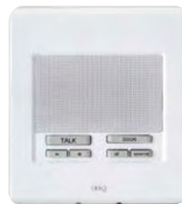
IC5004-XX Selective Call Intercom Patio Unit