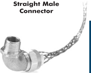
90° Male Connector