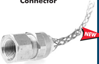
Straight Female Connector