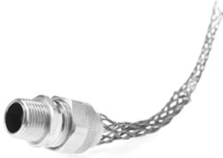
Straight Male Connector