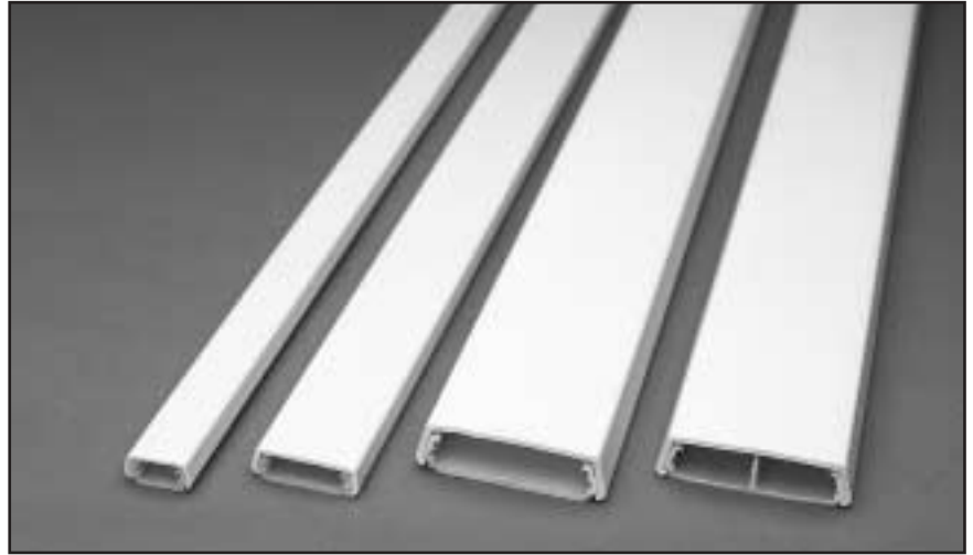
400, 800, 2300, and 2300D

The 400, 800, and 2300 Series, from The Wiremold Company, is a family of single compartment raceways for communication or power applications ideal for use in classrooms, office, and hotel applications or anywhere a small low profile raceway is needed. The 2300D Nonmetallic Divided Raceway is for use when power and low voltage cabling is required in the same raceway.