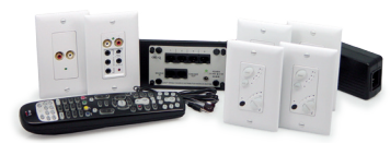
AU1012-XX lyriQ Single-Source, 4-Zone Kit with Flush Mount Input