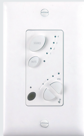
LyriQ Keypad (AU7394-XX)

Built on Cat 5 cabling, the LyriQ Audio System includes easy installation features such as convenient RJ45 connections.