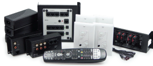
AU1005-XX lyriQ High Performance Multi-Source, 4-Zone Kit