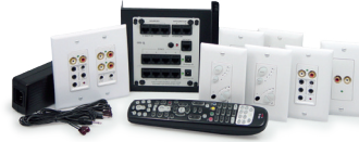
AU1021-XX lyriQ Multi-Source, 4-Zone Kit with Flush Mount Inputs