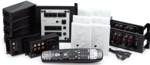
AU1006-XX lyriQ High Performance Multi-Source, 6-Zone Kit