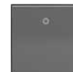
Paddle Optional Accessory