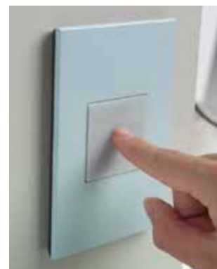
Press on nightlight to remove from wall