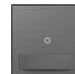
SensaSwitch Standard Feature