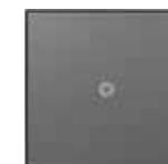
softTap Standard Feature