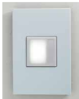
In-wall nightlight function