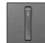
Whisper Optional Accessory