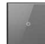
Touch Standard Feature