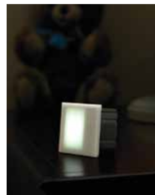
Portable flashlight function