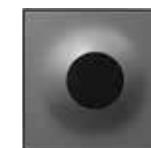
Wave Standard Feature