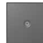
Push Optional Accessory