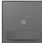
SensaSwitch Standard Feature