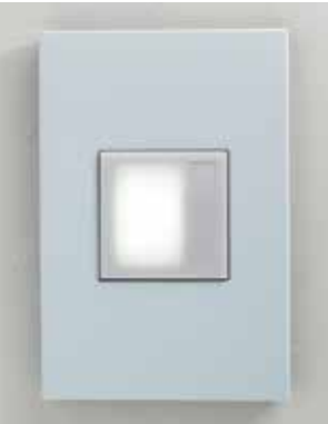
In-wall nightlight function