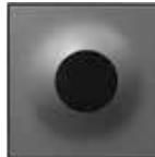
Wave Standard Feature