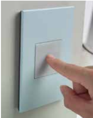
Press on nightlight to remove from wall