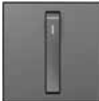
Whisper Optional Accessory