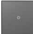
sofTap Standard Feature