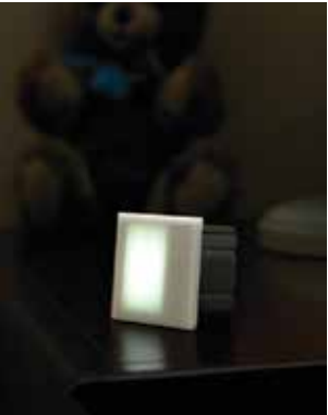
Portable flashlight function

The Accent Nightlight is a stunning addition to any adorne product and is compatible with any* 1- through 4-Gang wall plate. The device is invisible once installed, but can be activated by placing a finger under the wall plate. This will cause the light to cycle through several light level options, as depicted in the chart below.