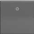
Paddle Optional Accessory