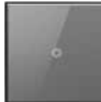
Touch Standard Feature