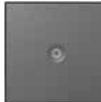
Push Optional Accessory