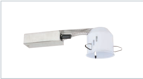
DESIGNED FOR 2" X 4" JOIST CONSTRUCTION (3-5/8" IN HEIGHT)