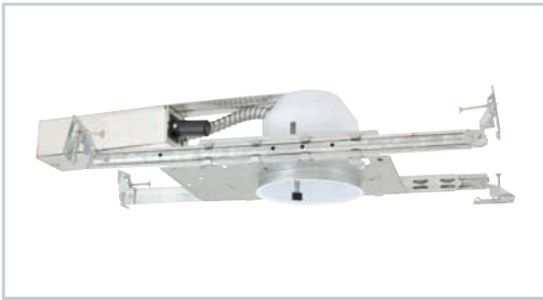
DESIGNED FOR 2" X 4" JOIST CONSTRUCTION (3-5/8" IN HEIGHT)