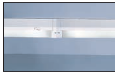
Joining Multiple Fixtures