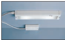
Direct Wire Installation