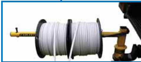
Hitch Mount (with Cablestik)