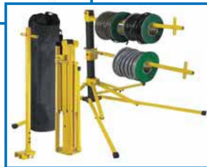
Free-standing Frame with extra Cablestik (and folded unit with bag)