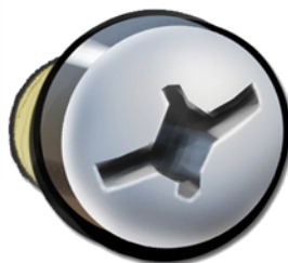
THE COMMON SCREW MANUFACTURED TODAY

....and seeing it as having the benefit of using either the square drive or the flat head screwdriver as a means of fastening. By combining the two, the surprising result is that the fastener and driver, become un-strippable.