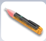
Fluke 1AC-II Volt Detector ($25.25 value)