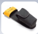
Fluke H3 Clamp Meter Holster ($25.05 value)