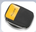
Fluke C35 Soft Case ($15.40 value)