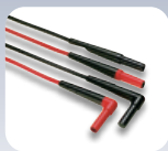
Fluke TL224 SureGrip™ Insulated Test Leads ($21.97 value)

Purchase a Fluke 337A True-rms Clamp Meter and choose one of these great accessories: