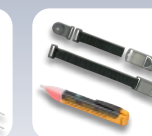
Fluke ToolPak Kit and 1AC-II Volt Detector ($57.12 value)