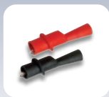
Fluke AC72 Alligator Clips ($12.73 value)

Purchase a Fluke 179 True-rms Multimeter with temperature and choose one of these great accessories: