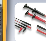
Fluke TL223 SureGrip™ Electrical Test Lead Set ($56.81 value)

Purchase a Fluke 287 True-rms Electronics Logging Multimeter or a Fluke 289 True-rms Industrial Logging Multimeter and choose one of these great accessories: