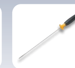
Fluke 80PK-24 SureGrip™ Air Temperature Probe ($87.67 value)