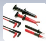
Fluke TL220 SureGrip™ Industrial Test Lead Set ($56.81 value)

Purchase a Fluke 789 ProcessMeter™ and choose one of these great accessories: