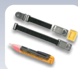
Fluke ToolPak Kit and 1AC-II Volt Detector ($57.12 value)