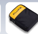
Fluke C280 Soft Case ($27.95 value)