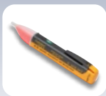
Fluke 1AC-II Volt Detector ($25.25 value)