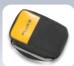
Fluke C35 Soft Case ($15.40 value)