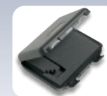
Fluke C101 Hard Case ($45.80 value)