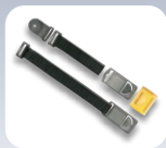
Fluke ToolPak, Meter Hanging Kit ($31.87 value)

Purchase a Fluke 87 V True-rms Industrial Digital Multimeter and choose one of these great accessories: