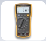
Fluke 117 Multimeter with Non-Contact voltage ($186.95 value)