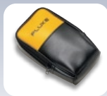
Fluke C25 Large Soft Case ($29.80 value)