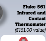
Fluke 561 Infrared and Contact Thermometer ($161.00 value)

Purchase a Fluke 435 Three-Phase Power Quality Analyzer and choose one of these great complimentary products: