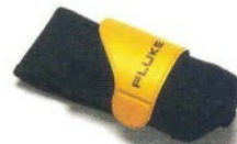
Case & Holster Compatibility Chart