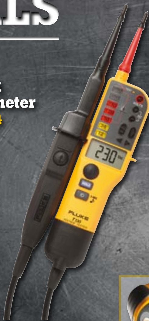
Two Pole Testers Fluke T100 series