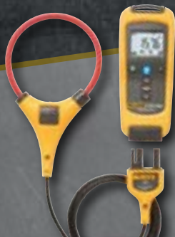
Fluke CNX i3000 iFlex™ AC Current Clamp