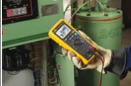
Use as stand alone