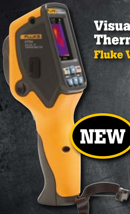
Visual IR Thermometer Fluke VT04