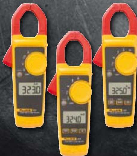
Fluke 323 Fluke 324 Fluke 325

Robust, easy, fast and safe, as expected from Fluke.