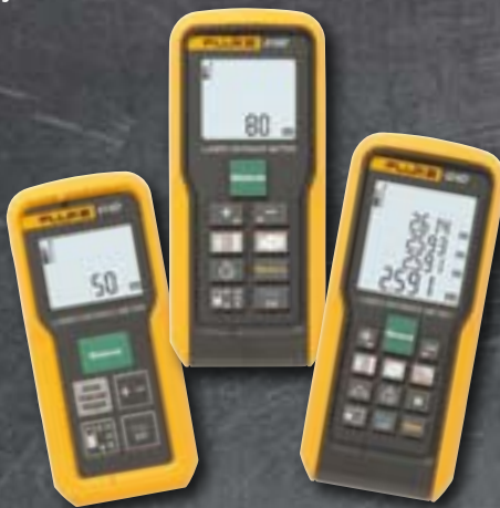
Fluke 414D Fluke 419D Fluke 424D

Fluke laser distance meters will become the next essential item on your toolbelt.