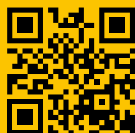
Multifunction Installation Testers Fluke 1650 series