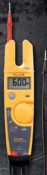
Fluke T5-600 Fluke T5-1000

The Fluke T5 testers let you check voltage, continuity and current with one compact tool.