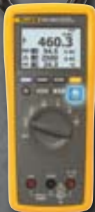
Fluke CNX 3000 Wireless Multimeter