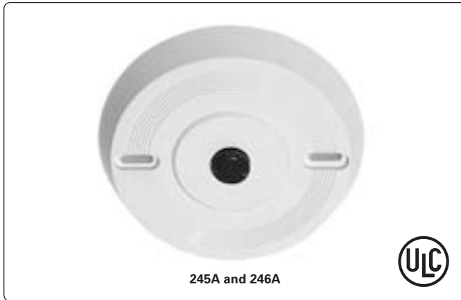
245A and 246A