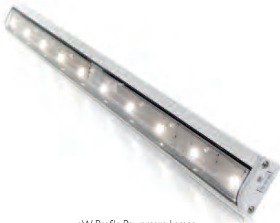
eW Profile Powercore Lamps