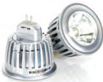
eW MR16 Lamps

For the most current product information, go to the e-catalog on www.philips.com