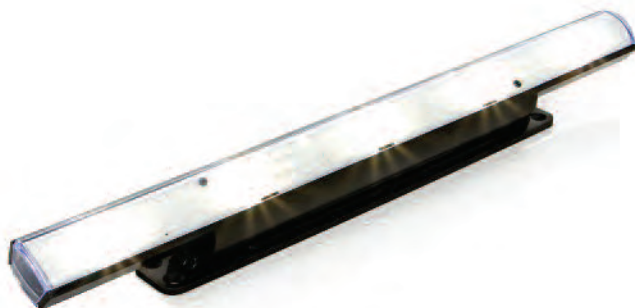
eW Cove Lamps

For the most current product information, go to the e-catalog on www.philips.com