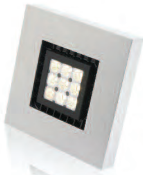
eW Downlight SM Powercore Lamps

For the most current product information, go to the e-catalog on www.philips.com