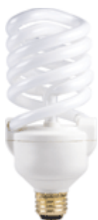
Helix Twister 11-34W Medium/E27