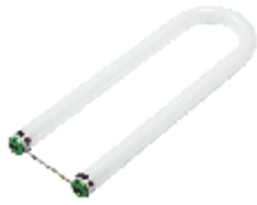
F- T12- UR Med Bipin/GB