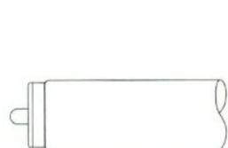
T12 Single Pin