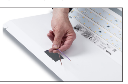
Step 3. Remove the two wires that were secured to the back of the plate.

Step 2: The plate can be removed before or after you install EvoKit SR. Just gently slide the plate to one end and remove.