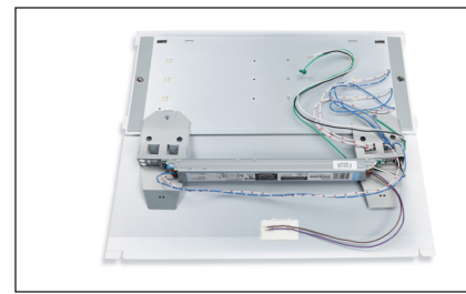
Step 1: EvokitSR is shipped with a plate covering the sensor hole. There are two wires secured to the back of the plate.

EvoKitSR is a new platform that allows users to choose different control platforms to suit their needs and budget; from simple occupancy and daylight sensing to cloud-connected data-reporting sensing. This empowers users to fine-tune their energy use for reduced energy costs. Contact your Philips representative for a current list of approved sensors. Sensors are connected in the field with just a few simple steps: