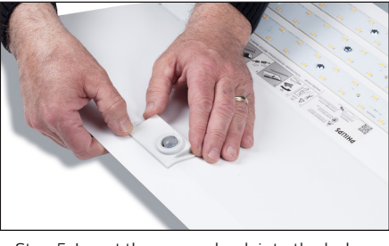
Step 5: Insert the sensor back into the hole. The sensor may or may not require a socket.

Step 4: Take these two wires and insert them into the sensor. They are not polarity sensitive.