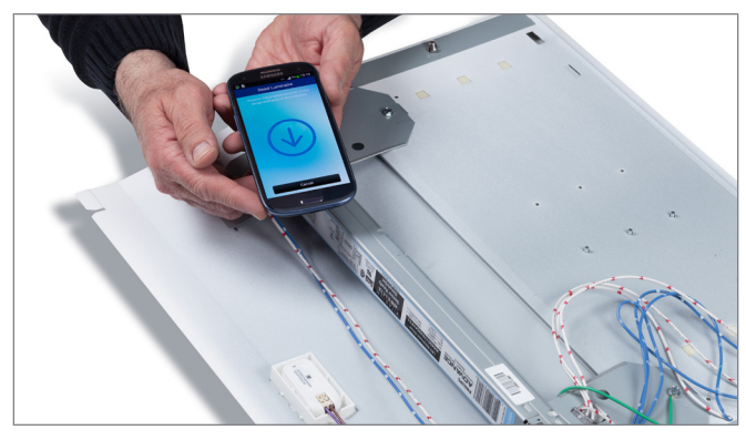
Step 1: Place the smartphone next to the NFC antenna on the driver.

EvoKit with new SimpleSet Technology allows the maximum lumen level to be set prior to installation using a smartphone-based app without requiring power to the luminaire. Available in the 0-10V and SR versions only. The app can be downloaded at Google Play. Please contact your Philips representative for the current list of approved Android smartphones. Distributors can set lumen levels prior to shipping, and contractors can set lumen levels prior to installation. Lumen level is quickly and easily set in two steps: