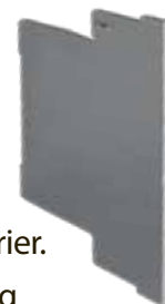
SBCMMW Wall Divider

Low Voltage / Line Voltage Barrier. Wall Dividers fit all (2) - (6) gang MM Boxes (in multiple locations).