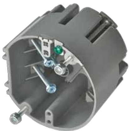
SBCFAN Fan box

An adjustable depth, new work, old work ceiling box. Extra deep for mounting all smoke and carbon detectors.