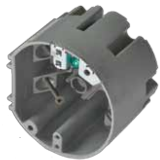
SBCRND Round Box

An adjustable depth, new work, old work ceiling box. Extra deep for mounting all smoke and carbon detectors.