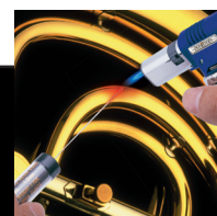
Solder and Desolder