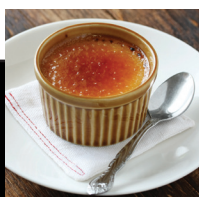
Caramelize Creme Brulee