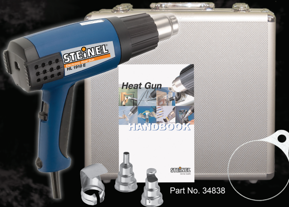
Part No. 34838