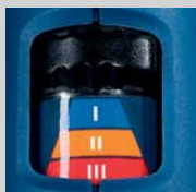
3 Stage Switch: Cool / Low / High