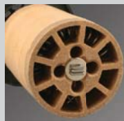
DuraTherm™ Heating Element