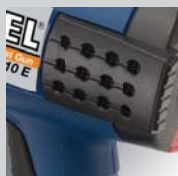
Dual Air Filters