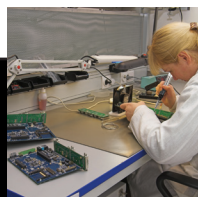
Desolder / Solder Circuit Boards