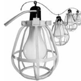
Flat Wire Cable Style