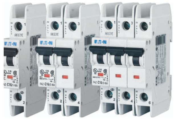
Optimum and Efficient Protection for Every Application