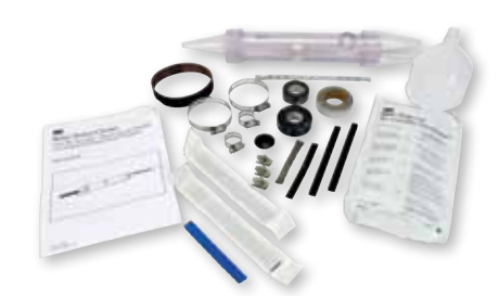
Kit for 3M™ Better Buried Closure

Tapered end caps can be trimmed and slit for exact cable size required. Single, double and triple entry styles are available dependent on size. When adding a branch cable to an existing cable, grooved end caps can be easily split in the field and quickly released with Locking "H" strips provided in each kit.