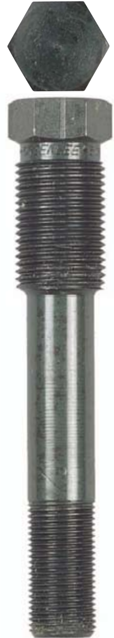
1434AV 3/4" (19.0 mm) x 5-1/2" (140 mm)