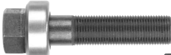
304AVBB – 3/4" (19.0 mm) x 2-15/16" (75 mm)