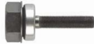
00042 – 3/8" (9.5 mm) x 1-5/8" (41 mm)