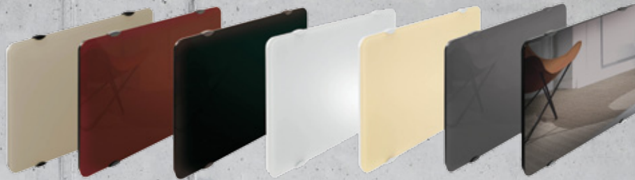
GOLDEN SAND COPPER BROWN ASTRAKAN BLACK WHITE LILY IVORY LACQUER GREY QUARTZ MIRROR