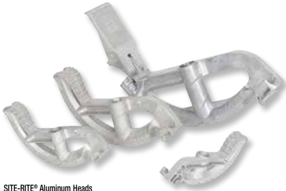
SITE-RITE® Aluminum Heads 840A, 841A, 842A, 843A